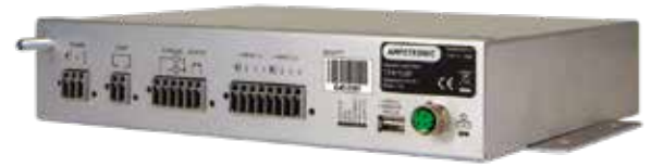
T14-1UW - Wago

With power supply options to suit most common rail and commercial vehicle power systems it is the obvious choice for any quality on-board audio system that requires an Audio Induction Loop.