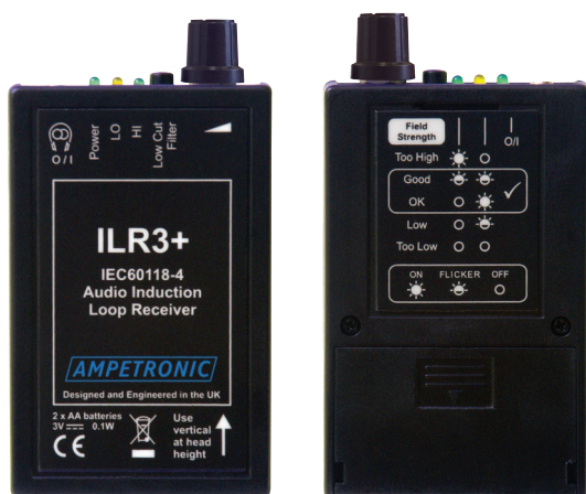
ILR3+ front view

The loop checking system comes with an easy to follow procedure for checking any loop system.