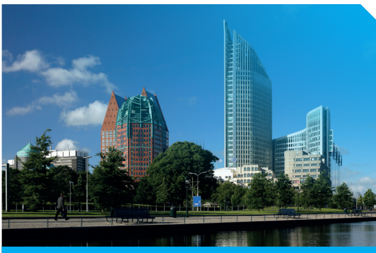
Ampetronic low-spill loops used on twenty nine floors of The Hoftoren, The Hague, The Netherlands

Ampetronic™ Loopworks™ productivity suite includes a powerful measurement app, and comprehensive specification and design tools. Such tools can be used standalone or when used in combination provide a holistic end-to-end solution to a hearing loop project, which can save time and money.